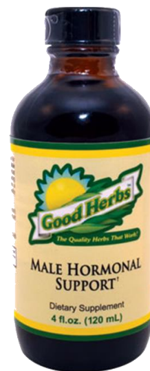
SKU: USGH000014 Herbal Supplement

Panax ginseng is a true ginseng, although it has a milder and more controlled action compared to the Chinese ginseng. It supports the hypothalamus-pituitary-adrenal (HPA) axis, helping maintain correct hormonal balance. However, it does not overstimulate the endocrine system.