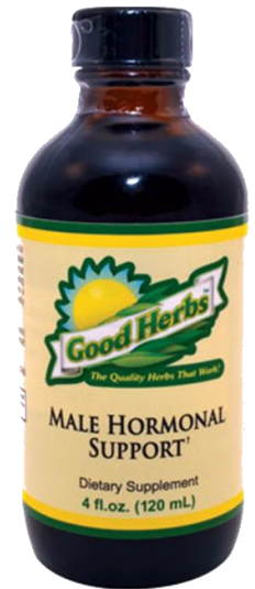
SKU: USGH000014 Herbal Supplement

Schizandra fruit, "the herb that does it all." It develops and protects the primary energies of life. Schizandra is an excellent herb for reducing stress. When the body is stressed, it releases a stress hormone called cortisol.